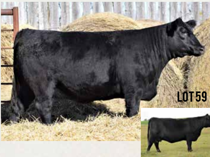
RRAR 10B - Maternal Granddam