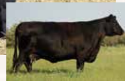
RRAR 3A - Materani Granddam

LOT 56 ..... RRAR BLACKWILLOW 9H 2135666 RRAR 9H January 4, 2020 Homo Black