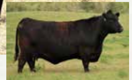
RRAR 24C - Maternal Granddam