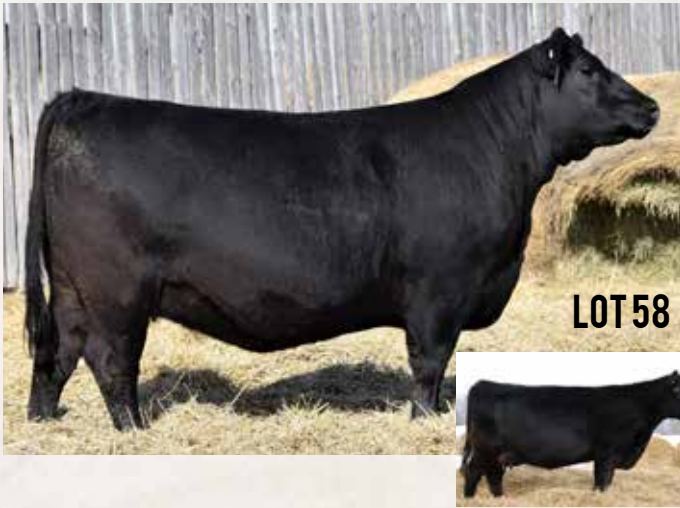
RRAR 31X - Maternal Granddam