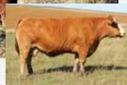
MBJ 54R - Maternal Granddam